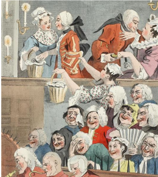
The Laughing Audience (William Hogarth, London, 1733)

Performance date: March 4, 2023 Venue: First Church of Christ, Scientist, NYC Attendance: 194