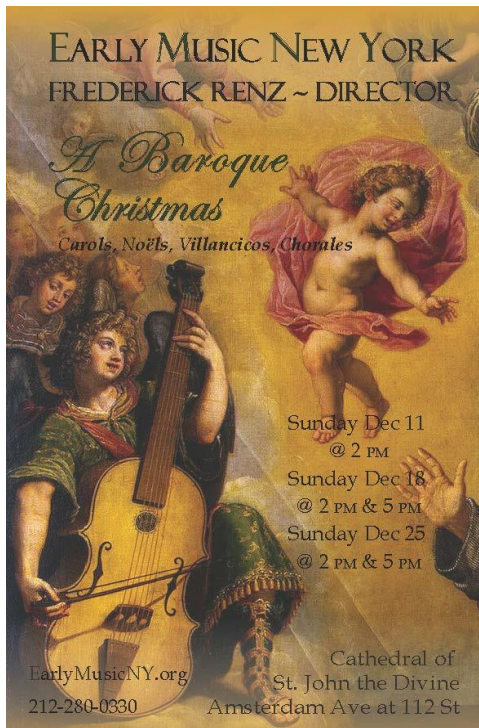
December 2022 concert postcard

A subscription brochure was mailed in summer 2022 for the 2022-2023 season. Promotional postcards for the season, the December 2022 program, and the two Spring 2023 concerts were distributed locally. EMF sent periodic "e-blasts" to potential ticket-buyers. Prior to concerts, press releases were sent to a list consisting of the metropolitan area's local classical music reviewers, as well as to broadcast announcers and program directors. EMF also listed performances on numerous online cultural calendars.