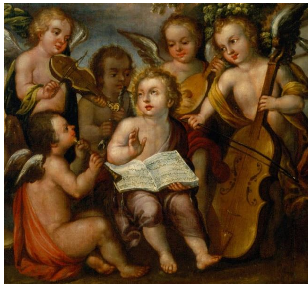
The Infant Jesus with Angelic Musicians, Detail (Juan Correa, México, ca. 1645-1716)

The performance at the Cathedral of St. John the Divine was in compliance with the Rehabilitation Act and the Americans with Disabilities Act (ADA).