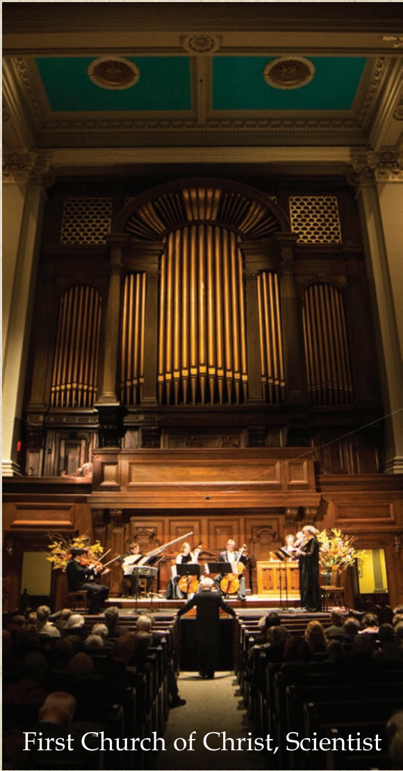
First Church of Christ, Scientist

Cathedral of Saint John the Divine Amsterdam Avenue at 112th Street