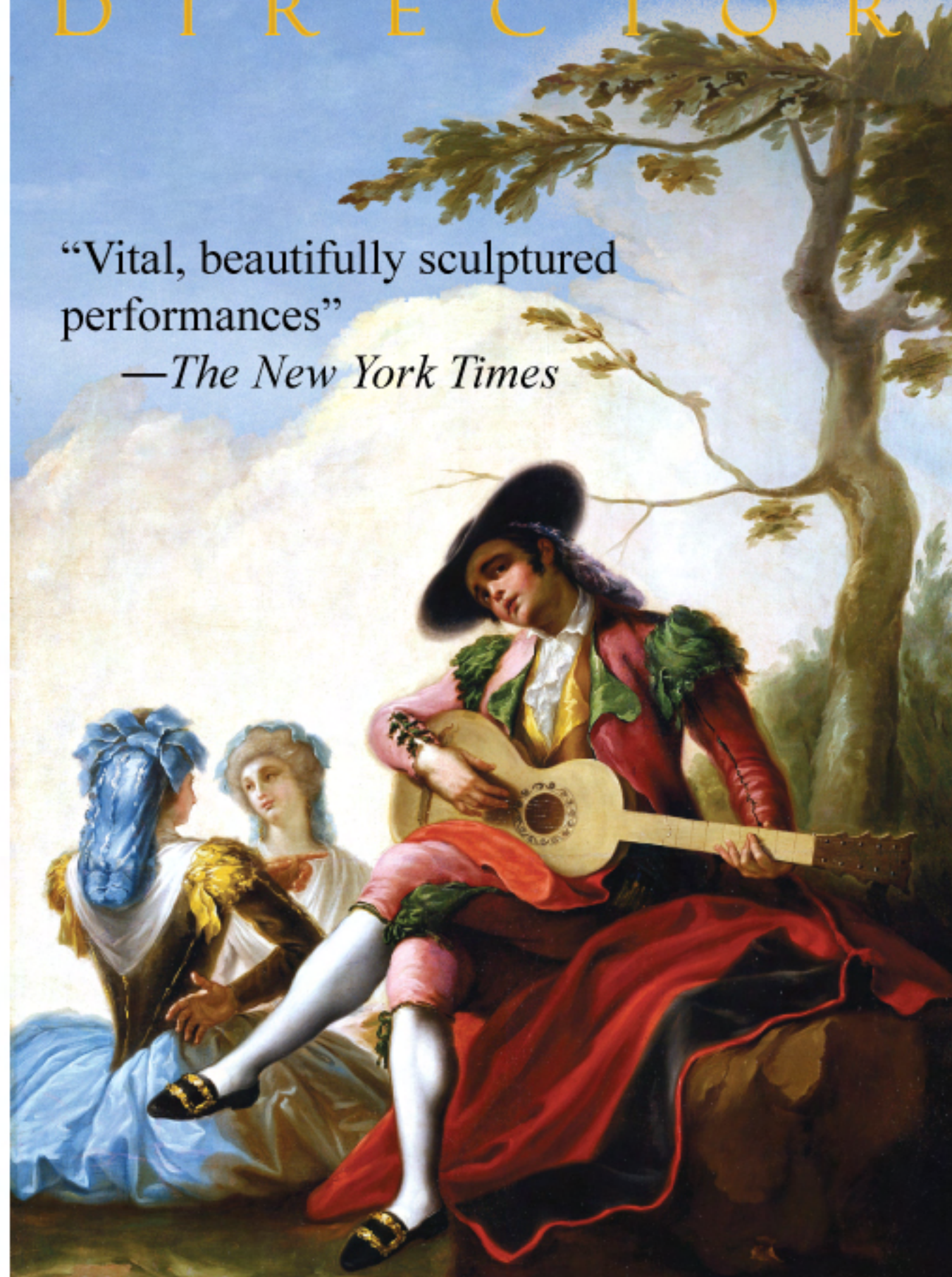
Ramón Bayeu y Subías - El majo de la guitarra, 1786.

“Vital, beautifully sculptured performances” — The New York Times